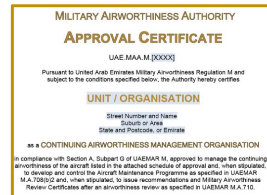
UAEMAR Form 14 – CAMO Approval Certificate