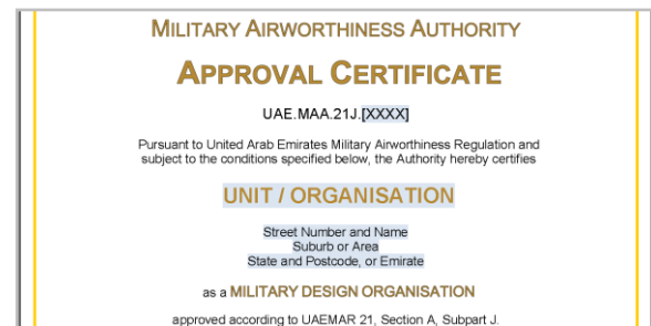
UAEMAR Form 102 - Design Organisation Approval Certificate

The issuance of an Approval Certificate is recognition that an organisation has demonstrated the capability to design, to validate design data, and to show and verify compliance with applicable airworthiness certification requirements.